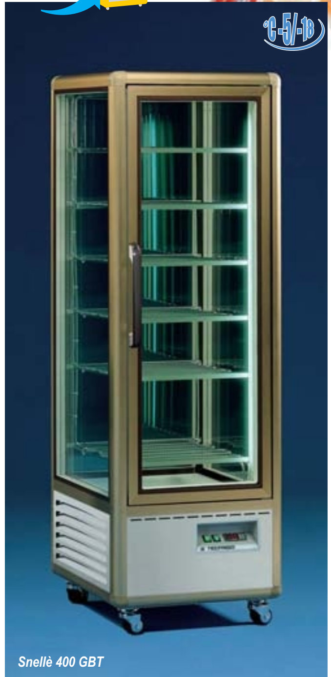
Snellè 400 GBT