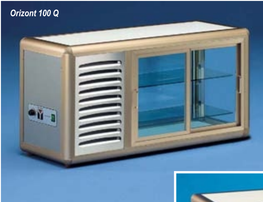
Orizont 100 Q