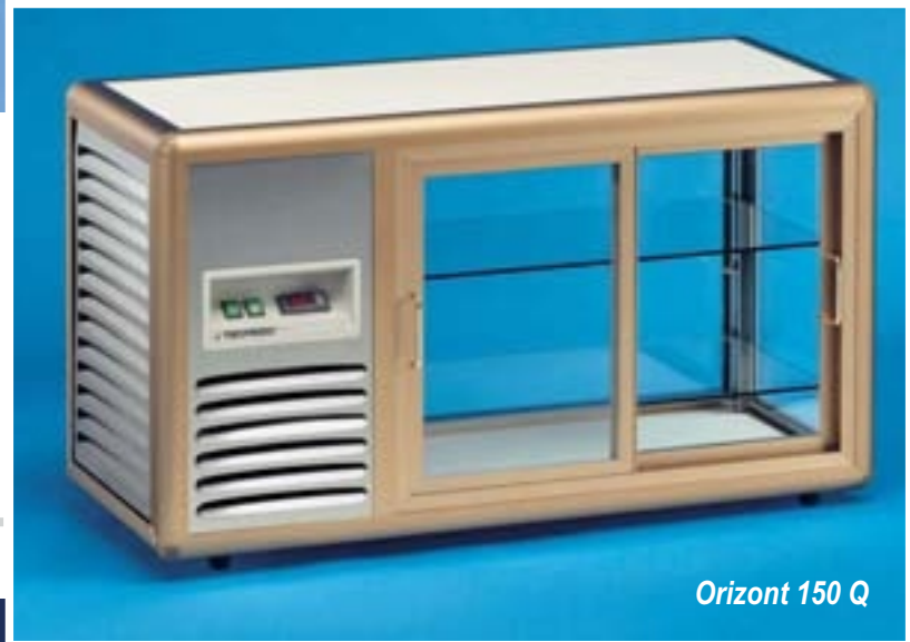
Orizont 150 Q