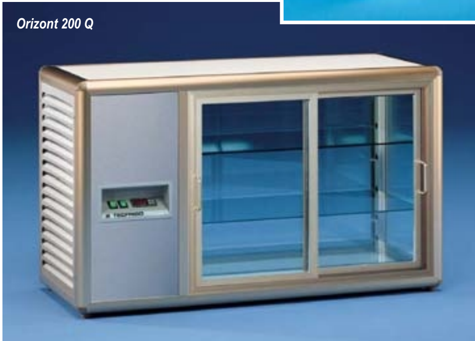
Orizont 200 Q